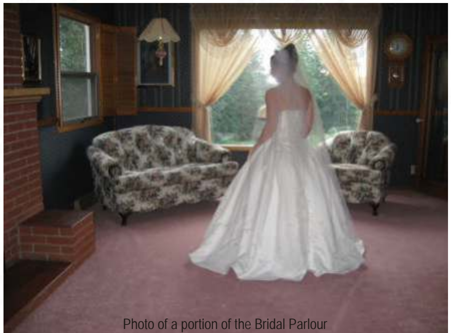
Photo of a portion of the Bridal Parlour