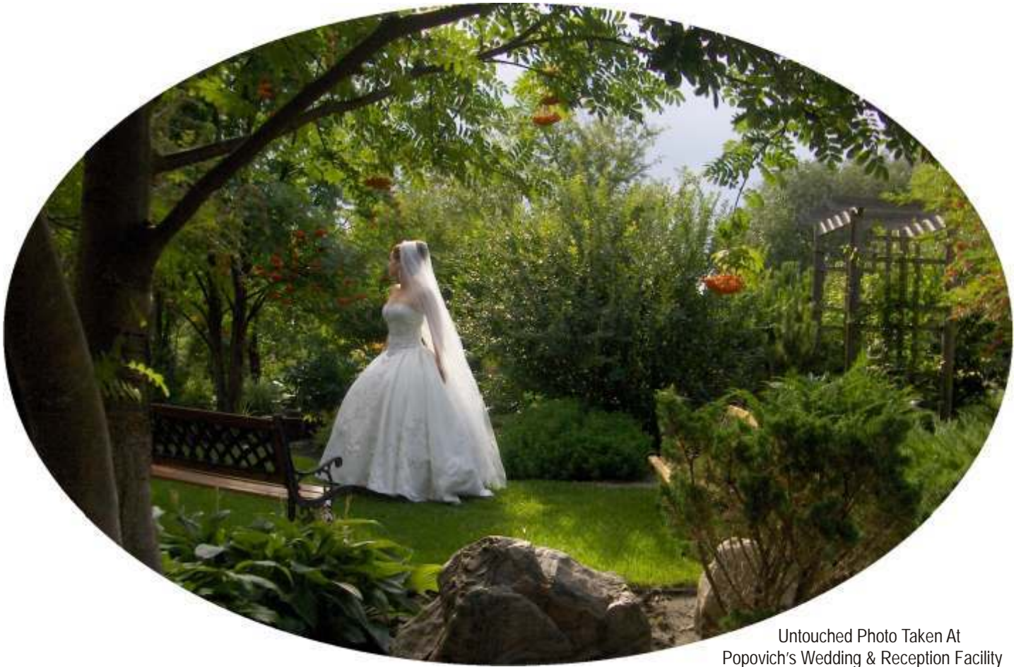
Untouched Photo Taken At Popovich's Wedding & Reception Facility